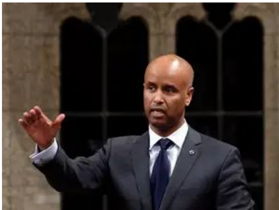
Hussen Minister of Citizenship and Immigration

“Canada is a nation of immigrants. We’ve always had immigration as a key tool for economic growth and nation building...There’s an understanding in Canada that immigration is a net positive for our society and that we should continue to have a very robust immigration system that welcomes those in need of protection but also those that want to come and give us their skills and talents...There are very substantial contributions to our economic growth, our prosperity, to our social and cultural mosaic that come from immigration”